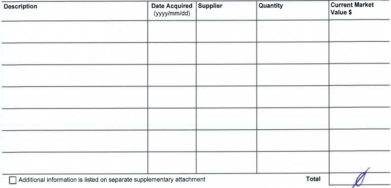
Table 4: Inventory of campaign goods and materials from previous municipal campaign used in this campaign (Note: value must be recorded as a contribution from the candidate and as an expense)